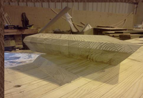
Multiple compound miter cuts and half width notching