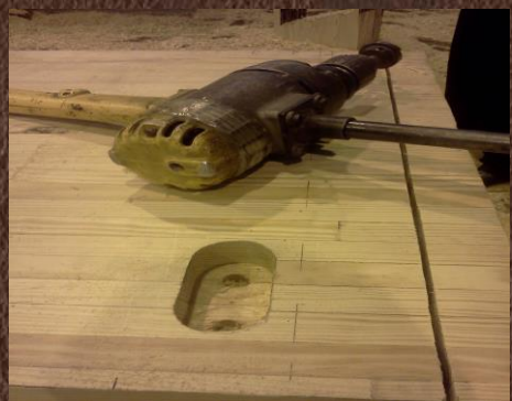
Intricate dapping done by hand.