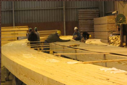
Years of experience contribute to an outstanding product.