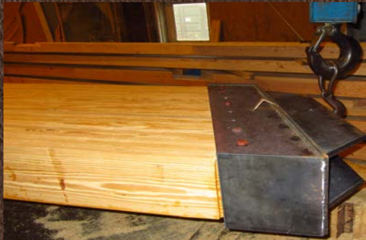
Shop pre-fitting of hardware ensures proper fit and time saving of erection at the jobsite.