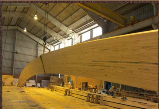
Handling and turning of members this size takes skill and coordination.

Structural Wood Systems continues to push the limits of laminated construction. This quarter's featured project is a prime example of the magnitude of laminated timber which S.W.S. is able to manufacture and ship.